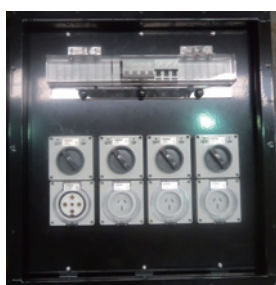
Output Panel CBR40

Sockets 3×15A + 1×32A Position: Mounted in rear panel, above alternator.