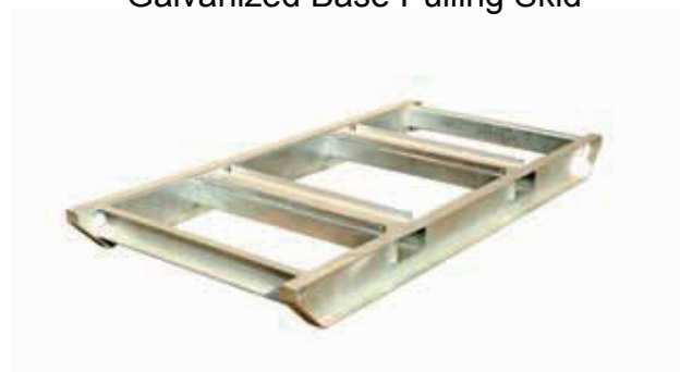
Galvanized Base Pulling Skid

Sockets 3×15A + 1×32A Position: Mounted in rear panel, above alternator.