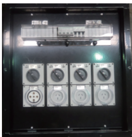
Output Panel CBR40

Sockets 3×15A + 1×32A Position: Mounted in rear panel, above alternator.