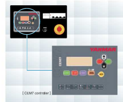
[ CEM7 controller ]

The M7 and CEM7 controllers are able to control operation, monitoring and protection of the generator. The controller unit consists of 2 different modules: